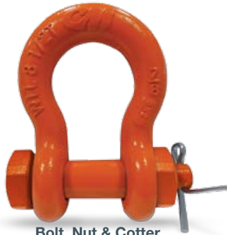
Bolt, Nut & Cotter